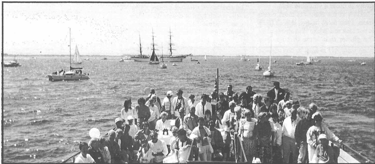
LWSA joins two other groups at Tall Ships Parade 11 miles out at Boston Light

I believe if we make these modifications, coupled with Brad's suggestions, we will have a much more enjoyable race with many more participants!